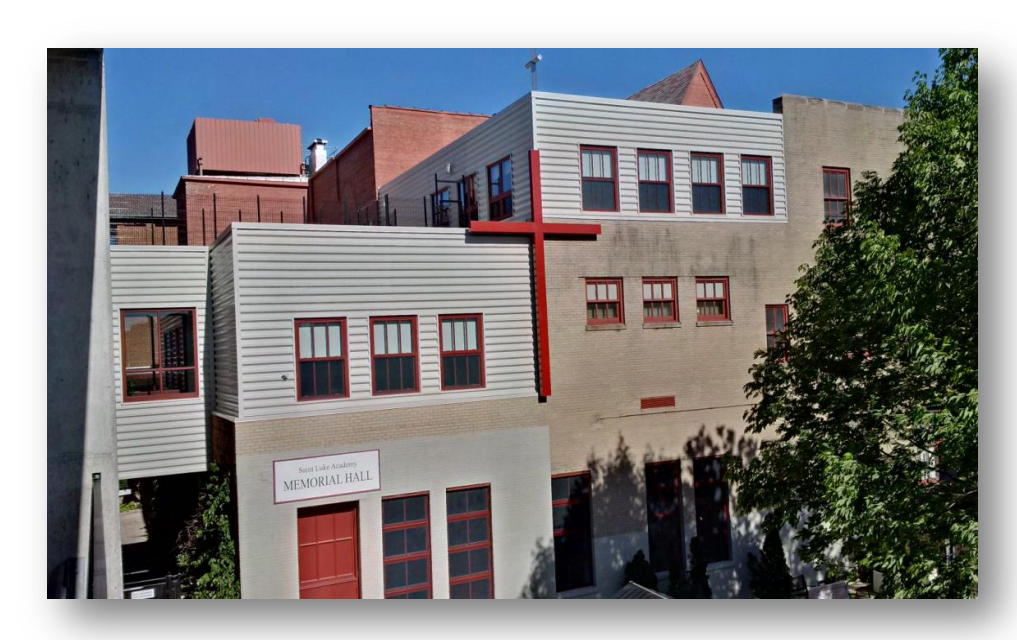
Classroom additions & bridge to the garage / elevator lobby after the additions were completed