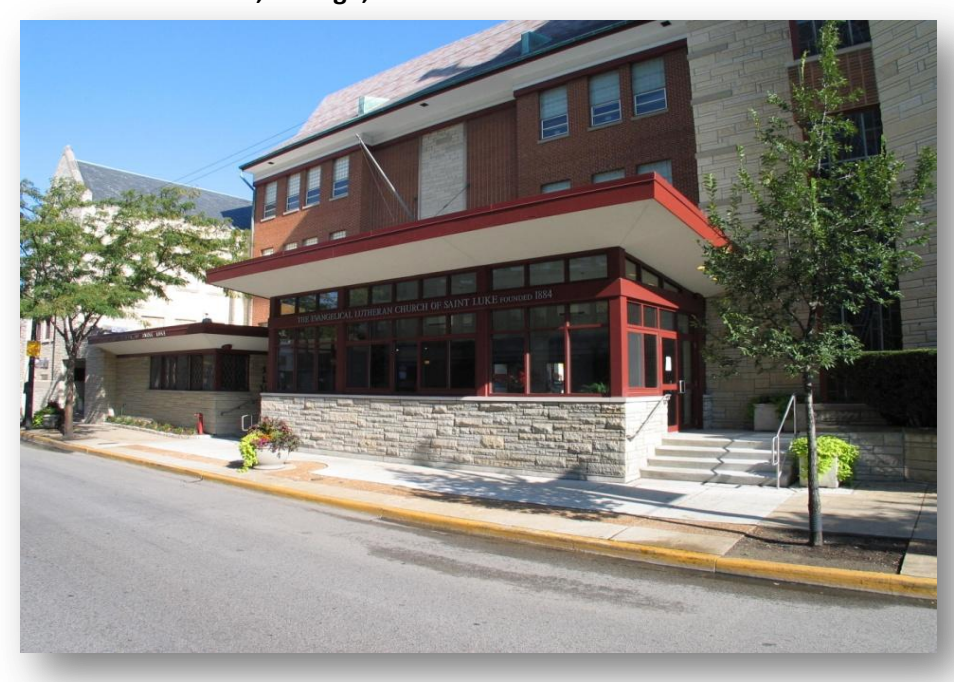
Close up of the new lobby addition