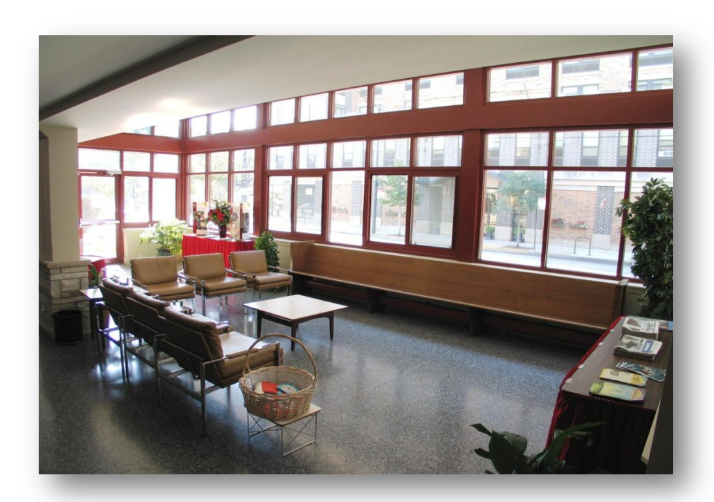
New lobby flex area