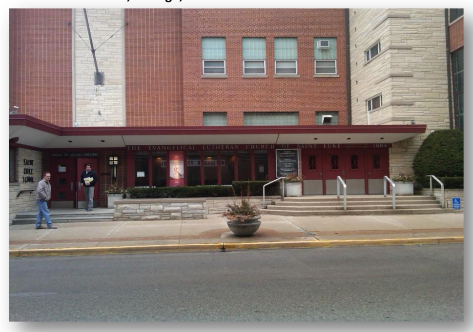
Front elevation before the new lobby addition