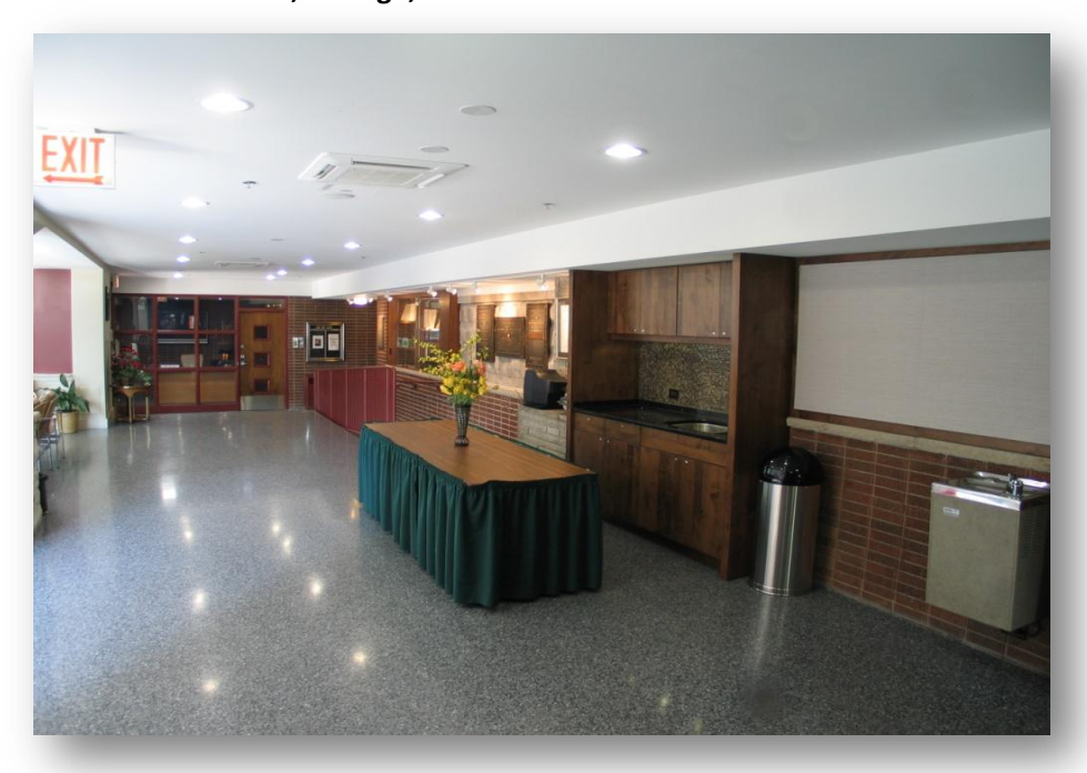
Lobby gathering area