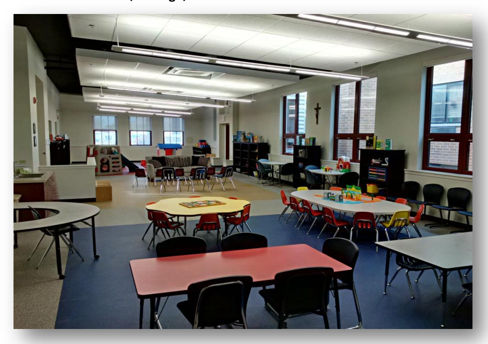
Second floor classroom addition