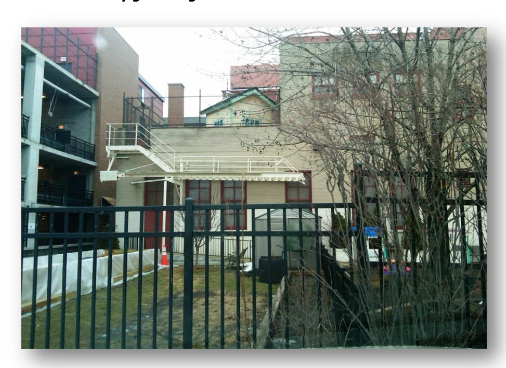
Classroom addition areas before construction